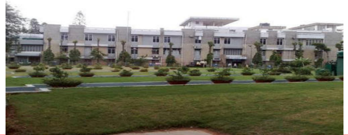
ST MARTHA'S HOSPITAL